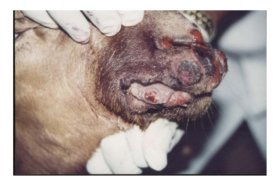
Fig. 3: Orf lesions, around the mouth and lips of naturally infected Swakni sheep.