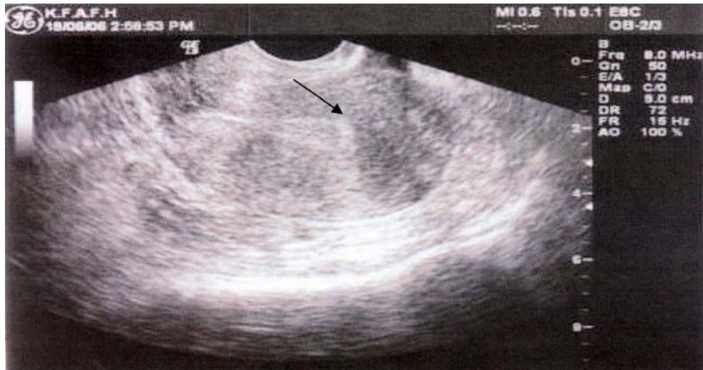
Figure (II): TVS after 1 month of Methotrexate injection