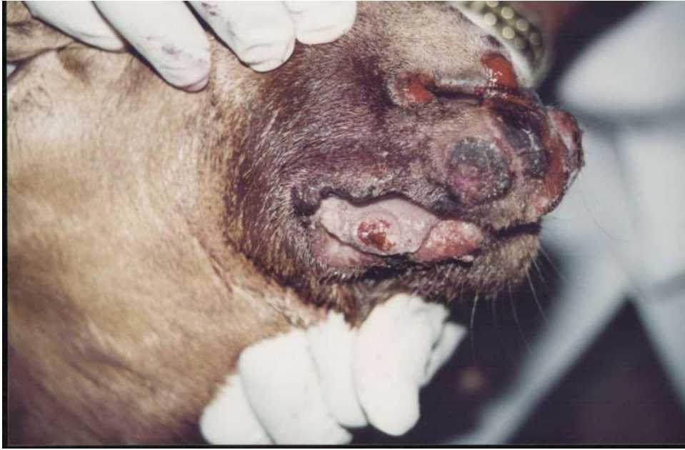
Fig. 3: Orf lesions, around the mouth and lips of naturally infected Swakni sheep.